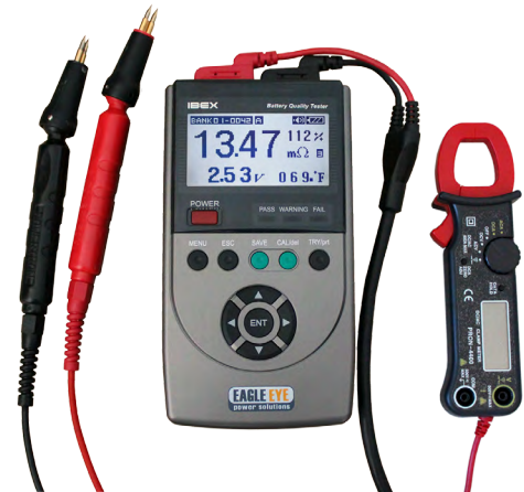
IBEX-Ultra with 4-Pin Test Leads and CT Clamp Meter